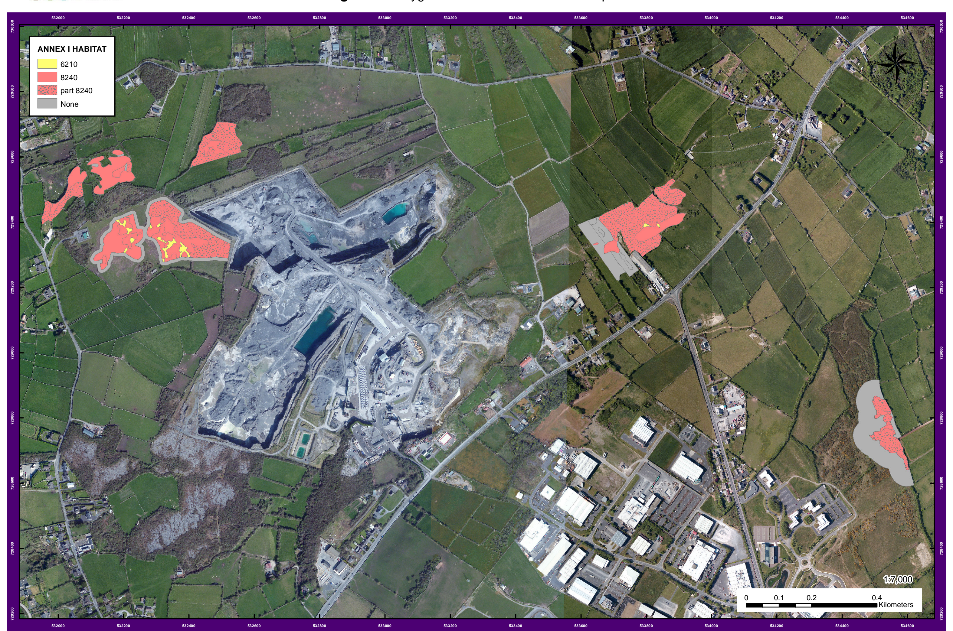
Figure 1. Ballygarraun area Annex I habitat map